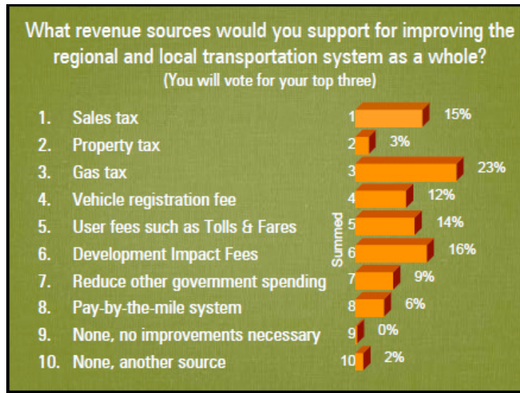
Figure 6-3: Revenue Sources for Transportation (NFRMPO 2008 Regional Summit)

NFRMPO recently prepared a report on transportation impact fees. At present development impact fees can only be used for capital expenditures. Some states allow such fees to be used for transit operations. As Colorado considers how to fund transit services as part of a multi-modal transportation network, it may be useful to explore this possibility.