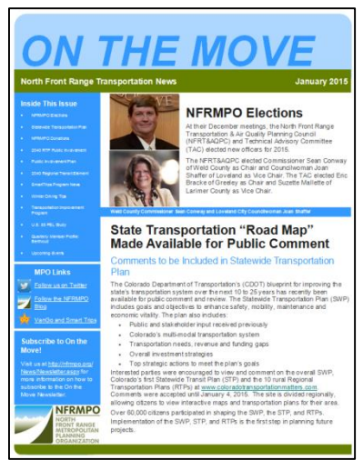
Figure 2: January 2015 On the Move Newsletter

The NFRMPO produces three newsletters each quarter: