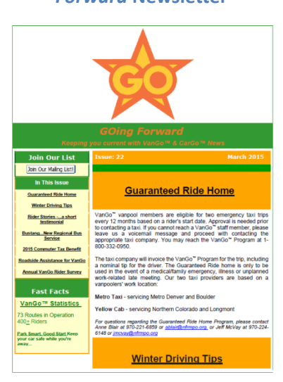
Figure 3: March 2015 GOing Forward Newsletter

The NFRMPO also uses newspaper and other relevant print media to advertise public meetings. Mobility Coordination, VanGo, and the Transportation team maintain a list of local media outlets for public notices. The lists are meant to reach impacted populations while broadcasting to as large an audience as possible.