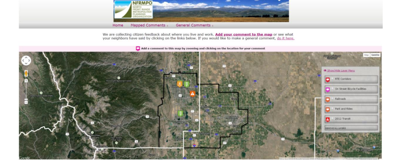
Figure 4: NFRMPO Community Remarks website

Community Remarks® uses Geographic Information Systems (GIS), Google Maps, and other staff-created maps to allow the public to comment on projects. The public has the option to "vote up" or "vote down" on comments. Future versions of the software will require commenters to explain negative comments and "down votes". Without receiving duplicate comments, staff can start to see how the public respond to certain ideas. This service was used in the NFRMPO's 2040 RTP outreach and can be reached via the NFRMPO's website.