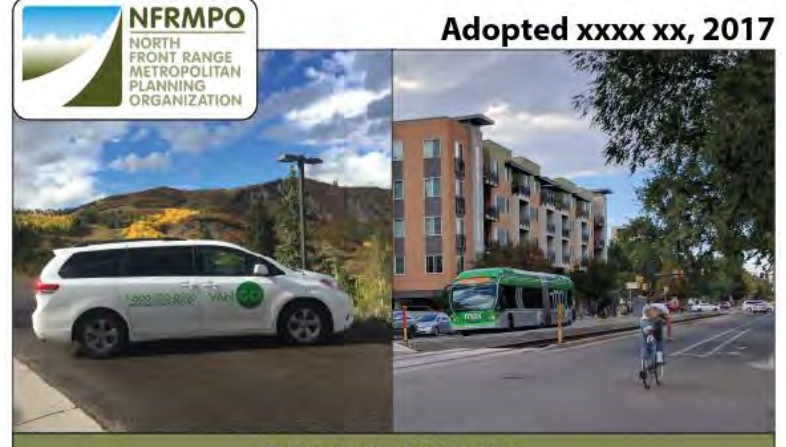
FY 2018 - FY 2021 Transportation Improvement Program (TIP)