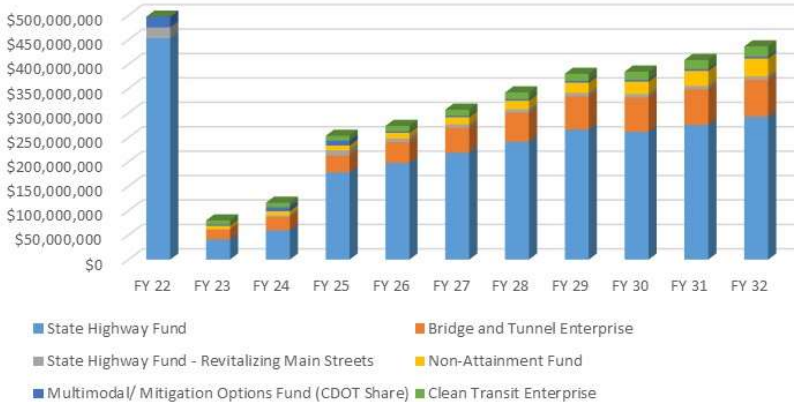
SB 260 Incremental Revenue to CDOT FY 22 - FY 32