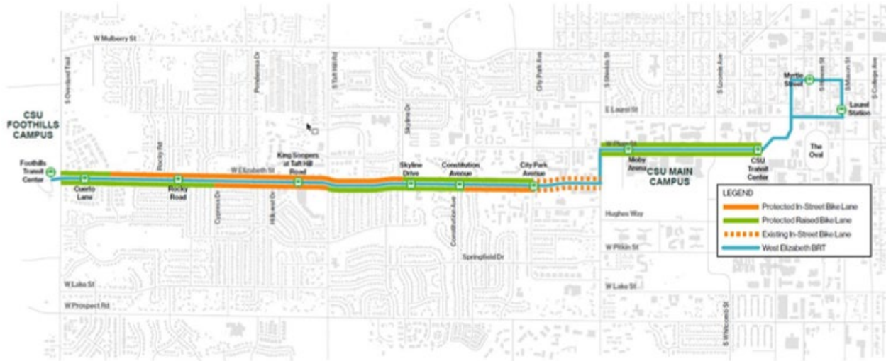
West Elizabeth Locally Preferred Alternative (Fort Collins)